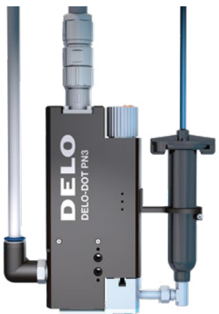
DELO-DOT PN3 with small cartridge