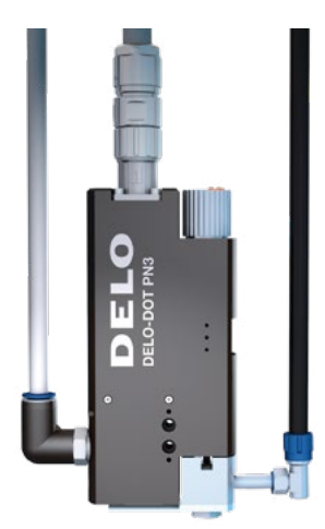
DELO-DOT PN3 with product hose