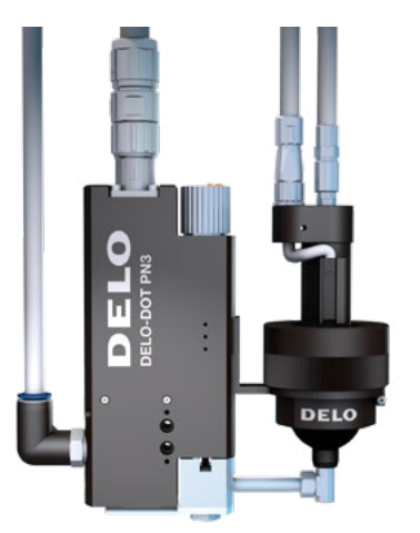
DELO-DOT PN3 with DELO-XPRESS pressure tank for DELO FLEXCAP