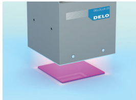
Transfer the adhesive to the tape phase